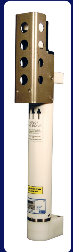
Deploy in orientation shown (sensors at top) for proper operation